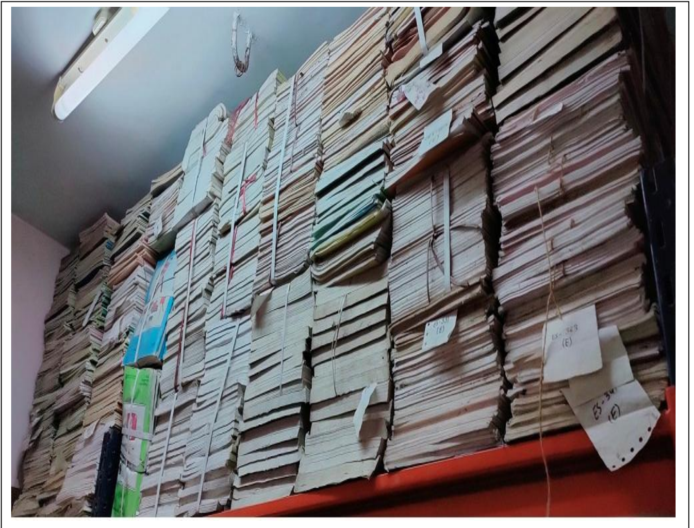
1. Old Obsolete Study Material