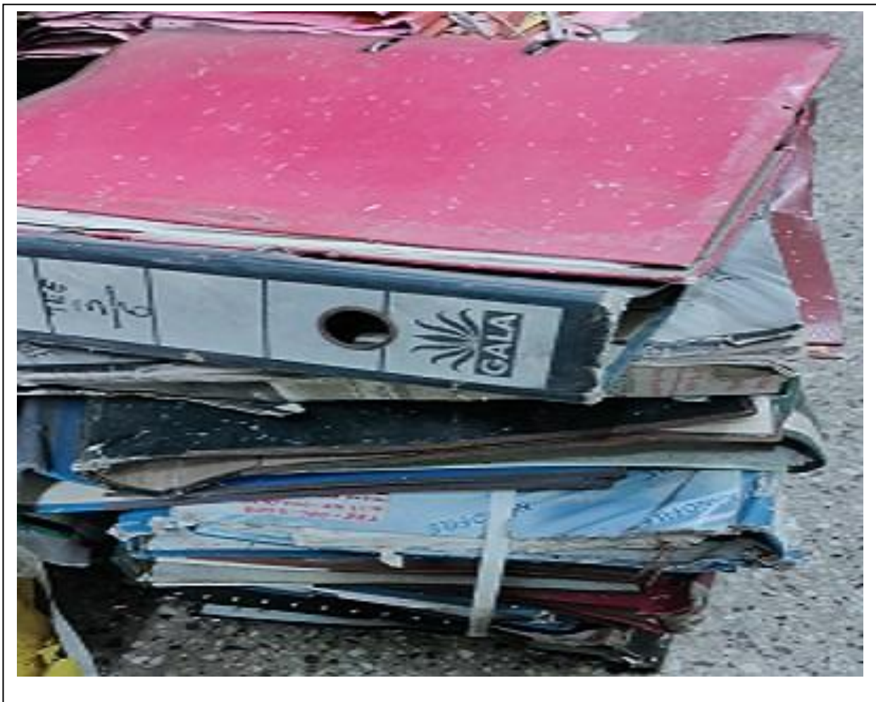
7. Box Files left by REC Pune