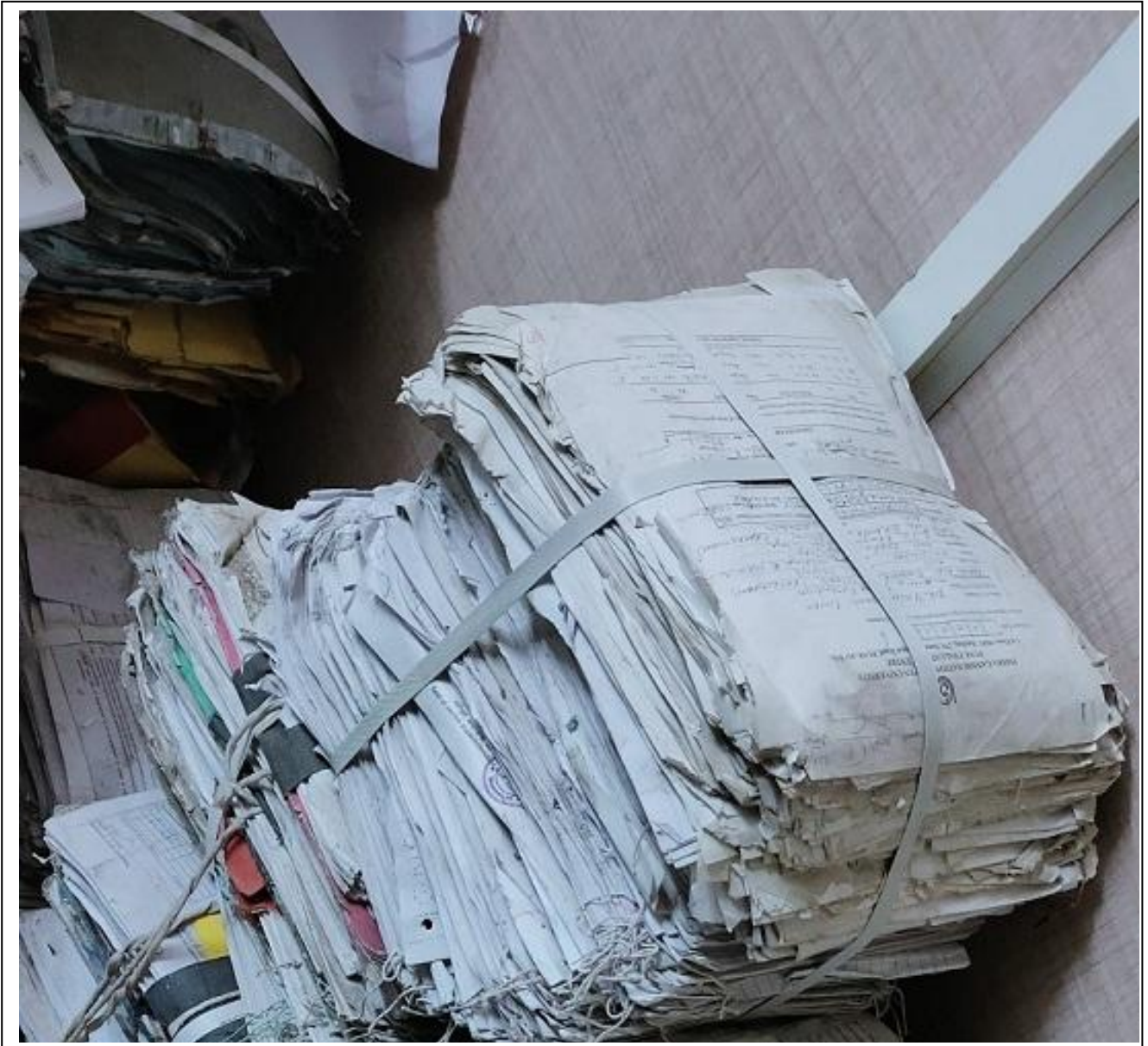
4. Loose Papers left by REC Pune