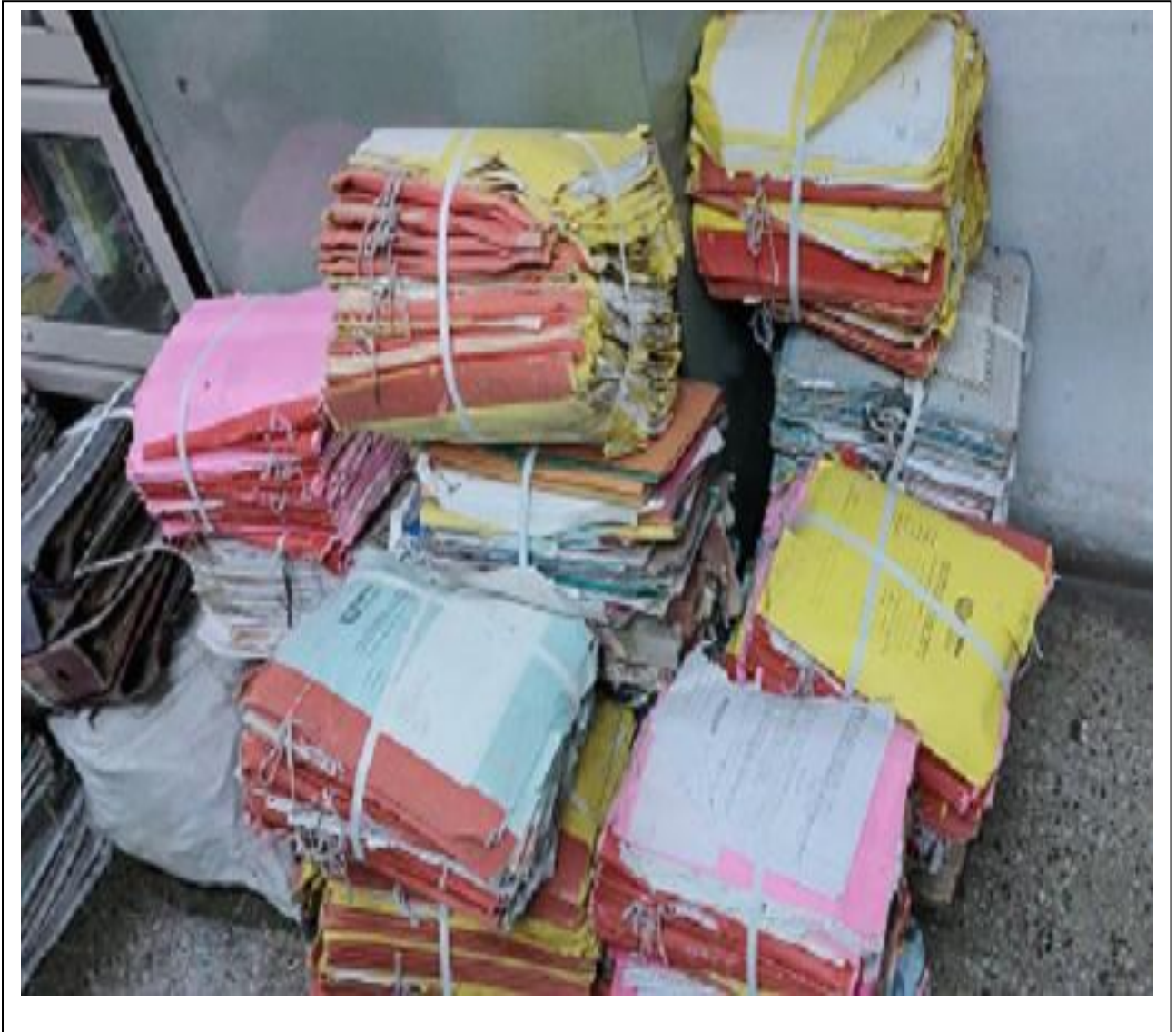
6. Files (Thin) left by REC Pune