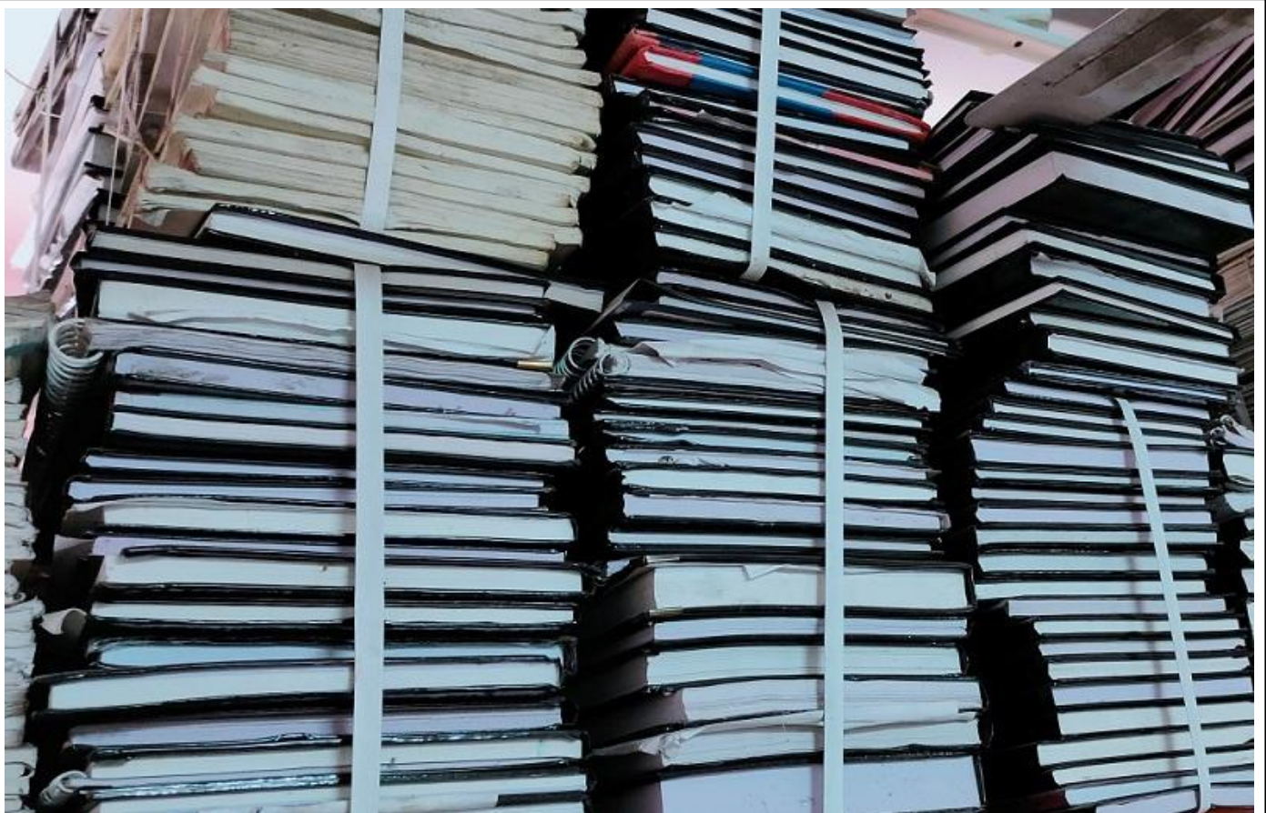
2. Evaluated Results Declared Old Project Report