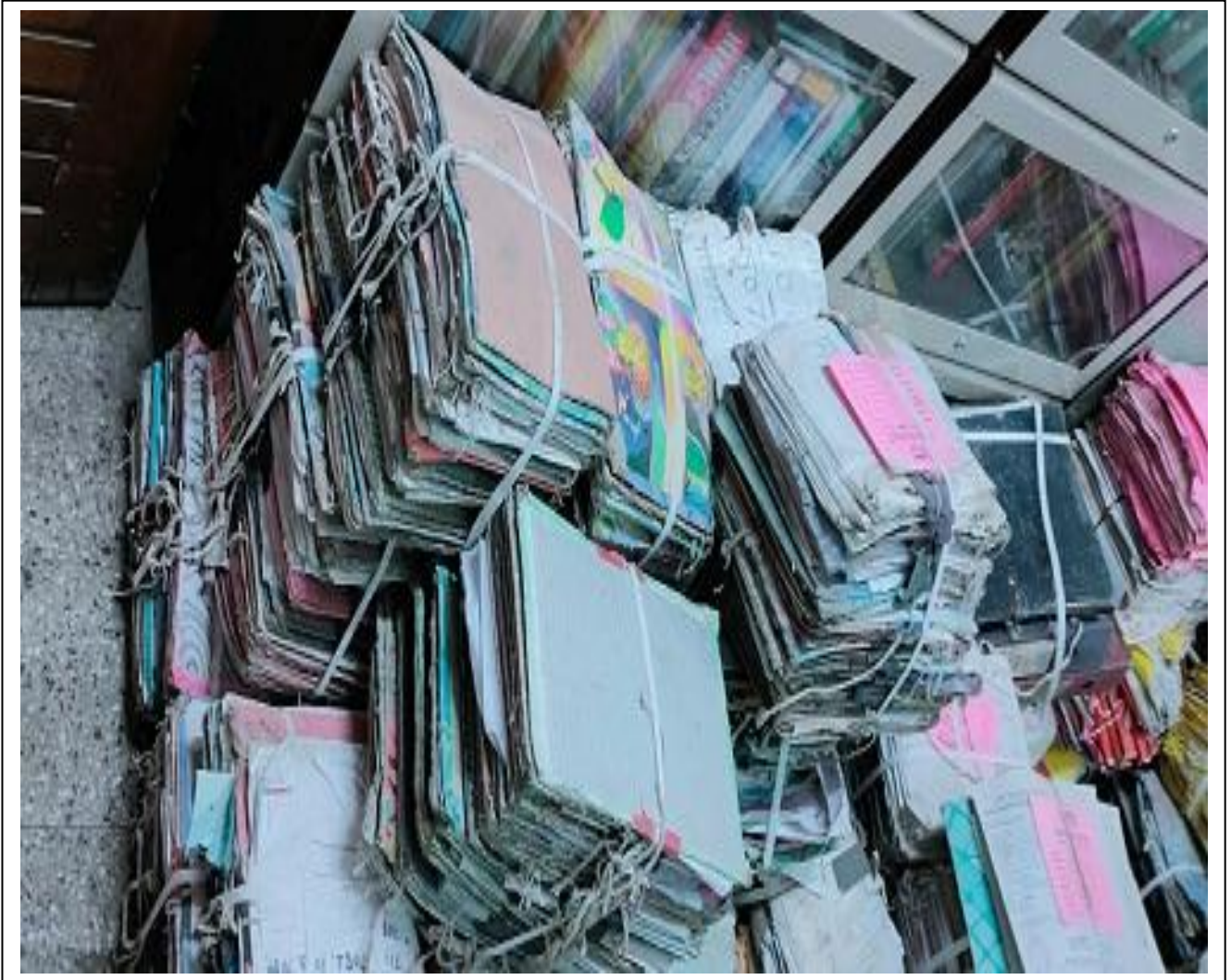
5. Folders left by REC Pune